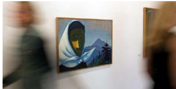
Werner Berg Museum, photo: Karlheinz Fessel

The Werner Berg Museum has become a magnet for art-lovers throughout Europe. The permanent exhibition includes over a 150 oil-paintings, wood-cuts and drawings by the artist, who was born in Wupertal Elberfeld in 1904 and, from 1934, together with his family settled at Rutarhof, a farm, in Lower Carinthia, where he lived as a painter and farmer until his death in 1981. Berg's work is also a unique documentation of his chosen home of south Carinthia. Following the completion of sensitive renovation the centuries old building in Bleiberg's main square now provides the ideal location for Berg's oeuvre. Meaningful extensions, such as the foyer lit from