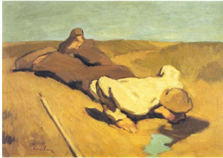
ALBIN EGGER-LIENZ, The Spring, 1924

Three painters, three regions, Albin Egger-Lienz (1868–1926), Alfons Walde (1891–1958) and Werner Berg (1904–1981) are considered prominent representatives of the Austrian Modernism. Notwithstanding their different origins, years of birth and education, these three painters all worked in regions outside the urban art centres of the first half of the 20th century. →