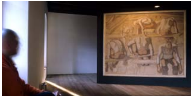
Museum der Stadt Lienz Schloss Bruck

Apart from the permanent exhibition of works by Albin Egger-Lienz, annually changing special exhibitions and works by contemporary