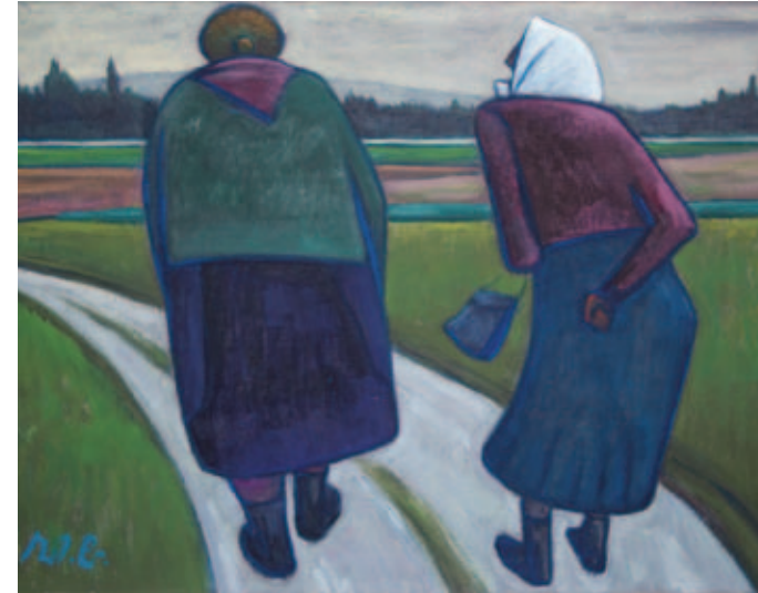
WERNER BERG, Two Women Walking, 1974, ©Werner Berg Museum

The works of Egger-Lienz, Walde and Berg are of current significance because, against the background of contemporary →