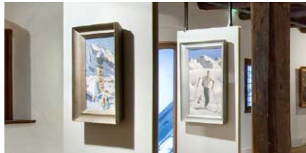
Museum Kitzbühel – Sammlung Alfons Walde

The Kitzbühel Museum – Alfons Walde Collection offers a unique insight into the history and culture of the town of Kitzbühel and the surrounding region. Carefully-selected exhibits, installations in film and sound illustrate local history covering the time from bronze-age mining around 1000 BC, to Kitzbühel's development as a town and winter-sports centre with Toni Sailer and the legendary Kitzbühel Dream Team of the 1950s. The museum's permanent exhibition focuses on Alfons Walde. Works by the Kitzbühel artist, including 60 paintings and over 100 drawings, photographs and graphic designs are on show on the third and fourth floor in an area comprising