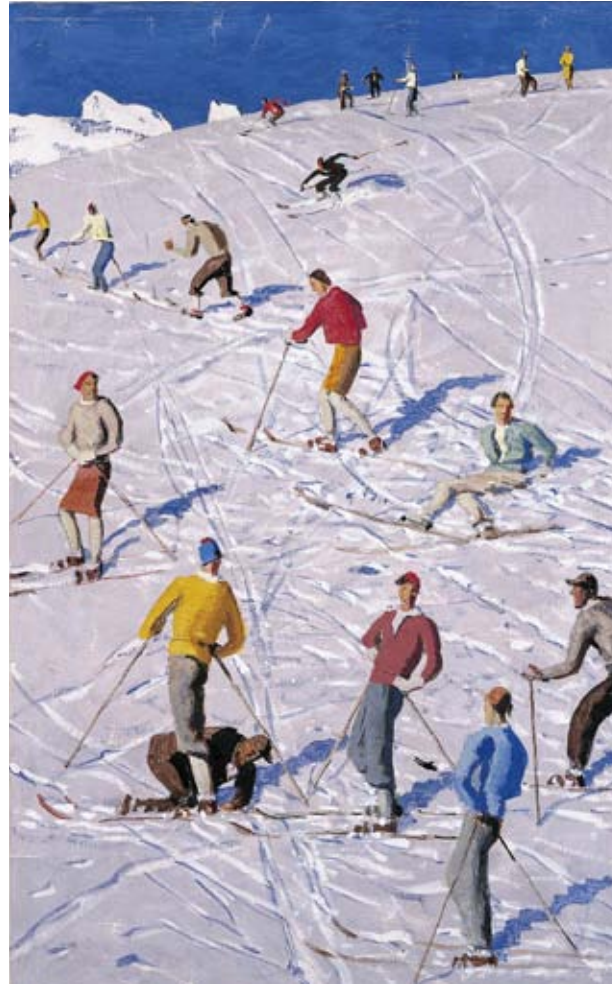
ALFONS WALDE, The Nursery Slope, c. 1925