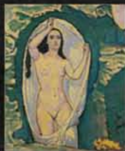
Kolo MOSER, VENUS in the grotto 1914

'The Power of the Word' contrasts with 'The Power of the Image' at the Werner Berg Museum in Bleiburg. The visitor learns how the great Austrian artists of the 20th century were able to realise visions of transcendence and divineness in their pictures.