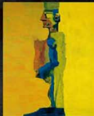
Hubert Schmalix, Alphaomega large IV, 1994

Catholic tradition of depiction and philosophy. How has each artist experienced divineness? This is the central question of the exhibition. At the same time, particular attention is paid to Werner Berg, whose work is otherwise displayed permanently in the museum. Furthermore, the new garden of sculptures features masterpieces of contemporary sculptural art for the very first time.