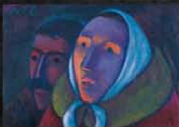
Werner Berg, Before the resurrection, 1965

The positions represented here encompass a wide range of