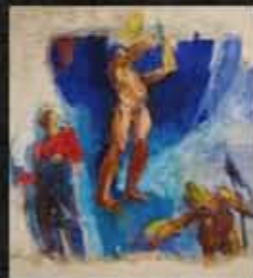
Anton Kolig, Entschwebung ('Floating Away'), ca. 1923

personal beliefs; in no way are they restricted to expressions of Christian imagery. They also comprise the fantastically visionary and heretical self-excoriation which follows on from an old, excessive, Baroque-